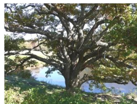
A thriving tree planted by an ever-flowing river

Which one depicts your life and which one do you want to be?: