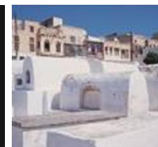
A whitewashed tomb (see Matthew 23:27-28)

Easter isn’t like Anzac Day where we merely commemorate past sacrifices and service that paid for our present freedoms. Easter marks past events that are meant to change us in the present and into the future. We know that Jesus didn’t stay dead, that he rose from the grave on the third day; but where is he in your life? Could he be frozen in time back in first century Roman Palestine, alive but absent? Is the resurrection of Jesus a theological truth to affirm and defend but not experienced and enjoyed?