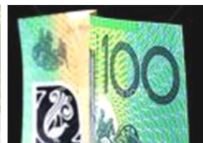
One hundred dollars placed in a low-interest bank account with high fees